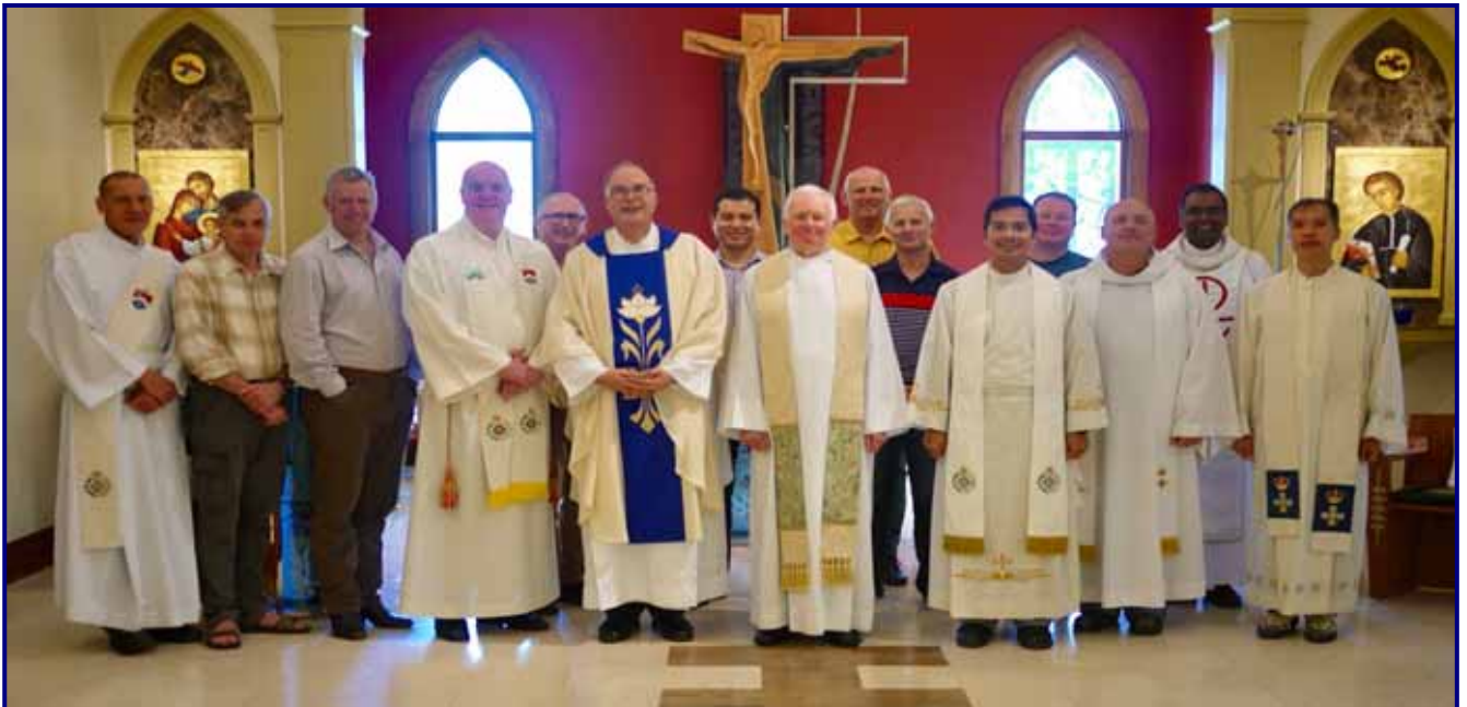
Chaplains at annual retreat, Marish Brothers Centre, Mittagong NSW, November 2016

The Holy Father addressed a group of recently-appointed bishops in Rome on 16 September, urging each of them to make their ministry a 'symbol of mercy'. As is characteristic of the Pope, he spoke in plain language stating 'The world is tired of charming liars. And, I might say, of "trendy" priests or bishops ... The people of God have the perceptiveness of God and run away when they recognise narcissists, manipulators,