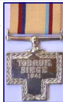
Commemorative medal issued by the Rats of Tobruk Association