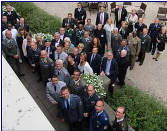
Delegates at the meeting of the International Military Apostolate in the Netherlands 18-22 September 2016

run. Military are often used in transporting refugees within their own nations – all while protecting them from any dangerous elements that infiltrate among them. Laudato Si calls us to show mercy, and the consensus that emerged from our discussions was that the hallmark of such mercy is deep respect in the care shown for each person, as made in the image and likeness of God.