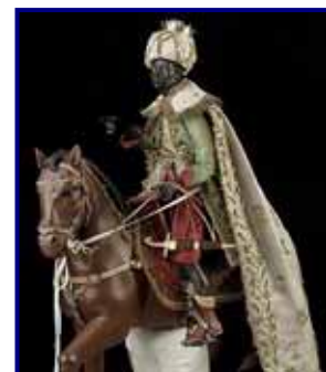
The Christmas Tree and some of the beautiful presepio figures at the Metropolitan Museum of Art New York

changes as new figures are added. The tree glows with light and features fifty angels. Around the base is the Nativity scene of a Neapolitan crib with the three Magi, shepherds and sheep, goats, horses, a camel and an elephant, and background pieces. Also included are the ruins of a Roman temple, a number of houses, and an Italian fountain featuring a waterspout from a lion's-mask.