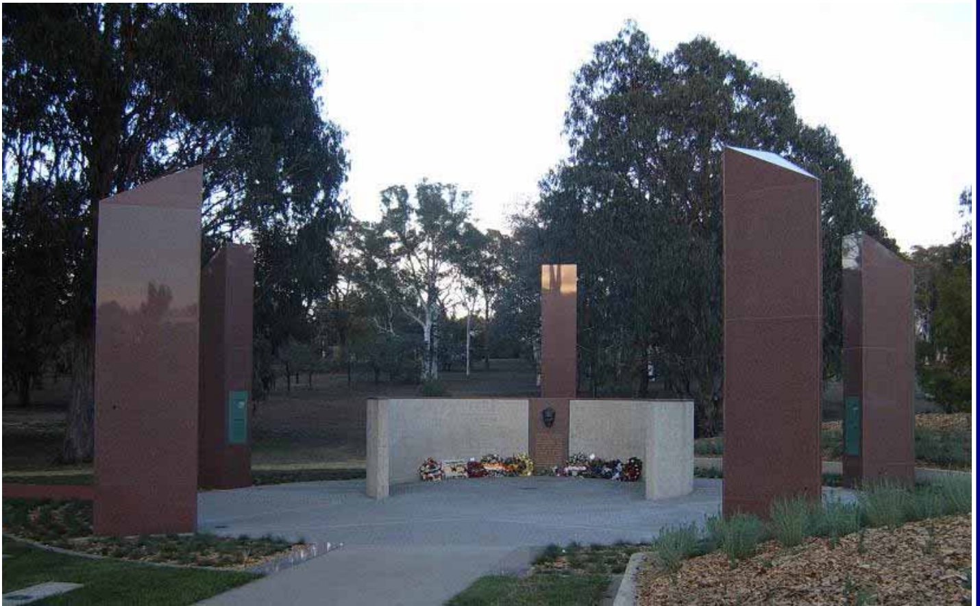
Kemal Ataturk Memorial Anzac Parade, Canberra

The Kemal Ataturk Memorial lies at the top of Anzac Parade Canberra, just below the Australian War Memorial. This site was dedicated on 25 April 1985 following agreement by the Australian and Turkish governments on a series of commemorative gestures to acknowledge the 70th anniversary of the Gallipoli landing.