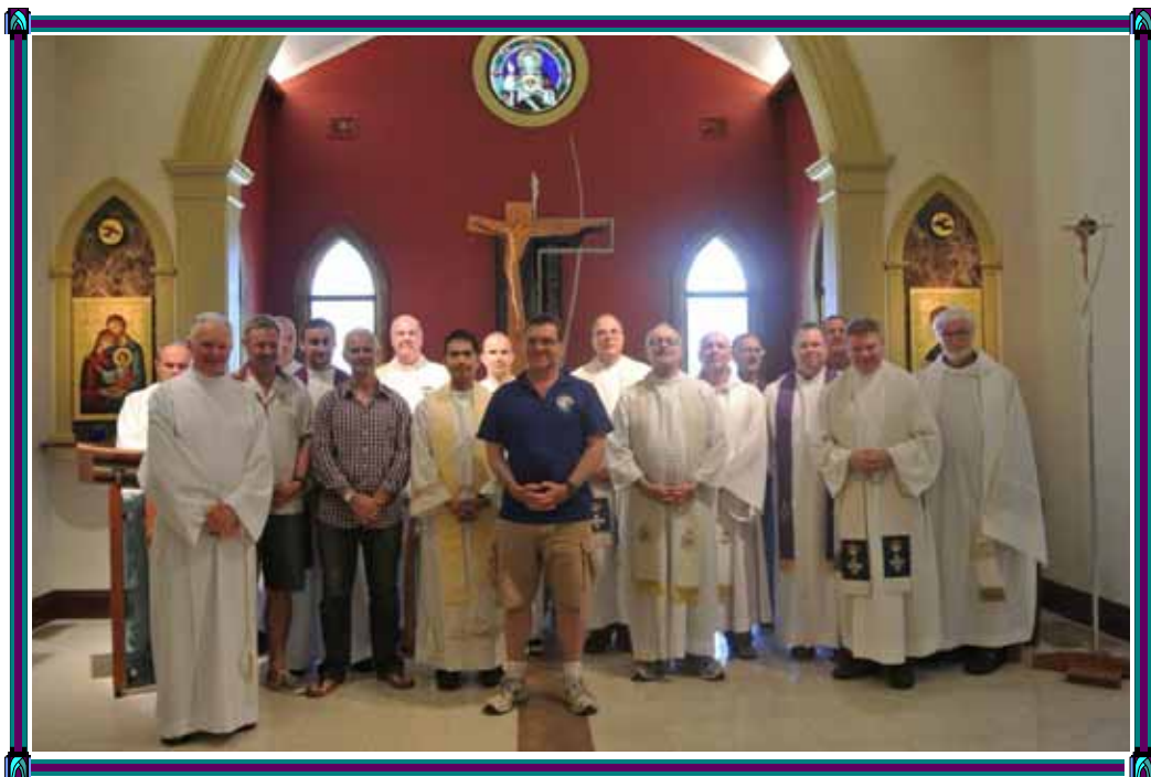
ADF Chaplains during their annual retreat at The Hermitage Marist Centre Mittagong 2014

Pope Francis also makes the point very clearly that consecrated life is not reserved just for a privileged few. To be consecrated is not only for the bishops, nuns, missionaries and priests. IT'S FOR EVERYONE. Being consecrated to God is a process of becoming holy; becoming more Godlike; and striving to live the values of the Gospel.