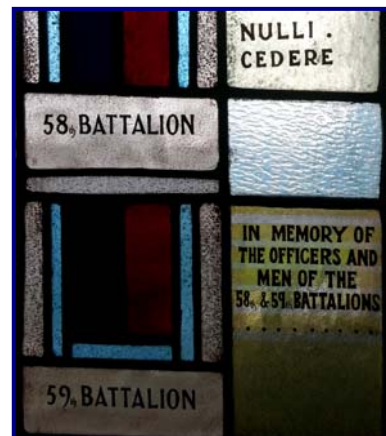
Photos showing details of the window. The motto 'Nulli Cedere' can be translated as 'Do Not Yield'

Japanese machine gun defence, the battalion captured the Old Vickers position after two days and so opened the way to Salamaua, which was captured on 1 September. This was followed by the fall of Lae on 16 September. After 77 days of continuous contact with the Japanese, the battalion was rested in the Port Moresby area.