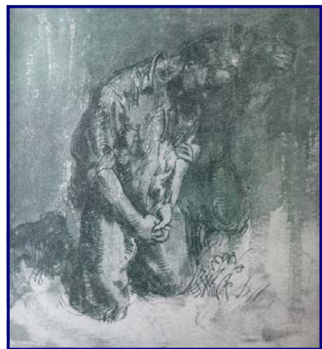
Service before Action