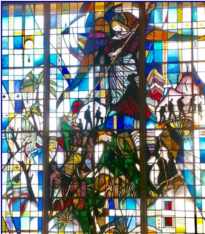
Window dedicated to deceased members of the 58/59th Battalion

A prominent feature at the entrance to the church are three large stained glass windows, one of which is a war memorial dedicated to the members of the 58/59th Australian Infantry Battalion who died during World War 2 in New Guinea and the Northern Solomons. This window is indeed an unusual feature in a Catholic church, but the reason subsequently became obvious to me when I realised that Father English had been a chaplain with the battalion.