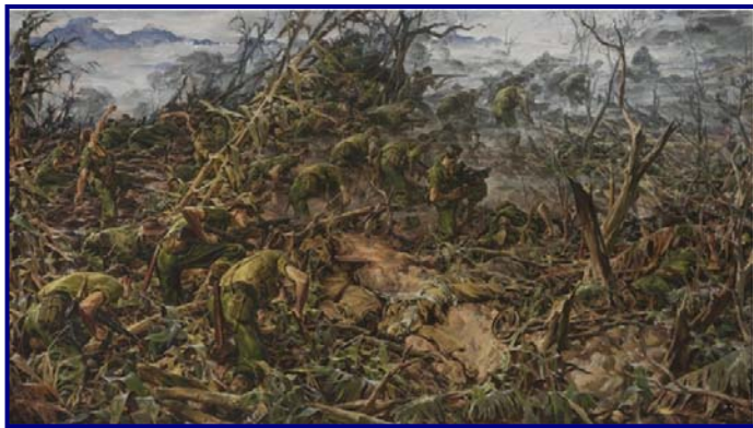
Taking Old Vickers Position, Bobdubi Ridge, 28 July 1943 Oil on canvas, Ivor Hele, 1960 Australian War Memorial ART27543